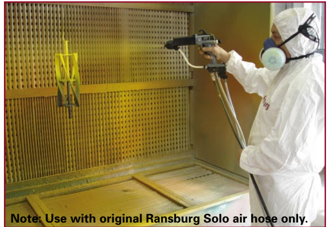
Note: Use with original Ransburg Solo air hose only.