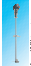
Part no. QS-574-H rotary Agitator