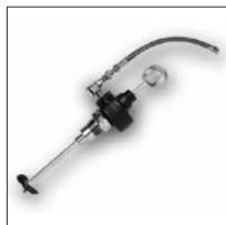
Agitator type D