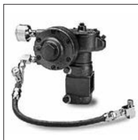
Agitator type I