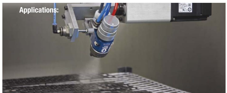
Graco's AirPro EFX™ Automatic Spray Gun automated air-operated application.